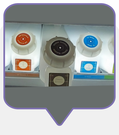
Easy Visibility to Check on Refills