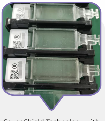
Cover Shield Technology with Min. Consumption of Reagents